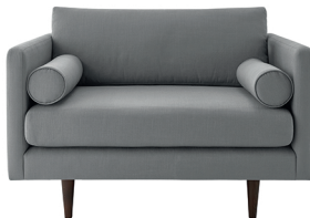
Snuggler H80 x W124 x D94cm