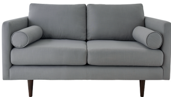
Small Sofa H80 x W174 x D94cm