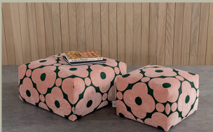
Longford Stools (large & small)