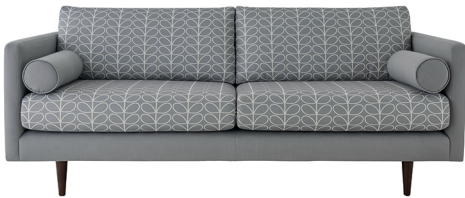
Large Sofa H80 x W234 x D94cm