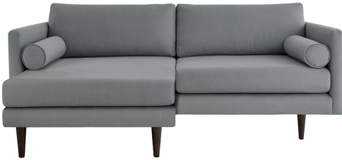
Large Chaise Sofa (interchangeable left/right hand facing) H80 x W234 x D154cm

Range shown in Foyle with American Walnut feet